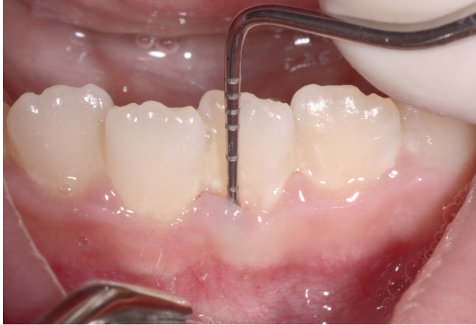
Figure 2. Periodontal evaluation.

bleeding score is defined as the percentage of sites bleeding with respect to the number of sites examined; probing pocket depth (PPD): is the distance from the gingival margin to the bottom of the gingival sulcus/pocket. It is measured by means of a graduated periodontal probe with a standardised tip diameter of 0.5 mm. Measurement is taken for each tooth at the mesio-buccal line angle, the mid-buccal, the distobuccal line angle, the distolingual line angle, the mid-lingual and the mesio-lingual line (six sites for each tooth). The physiological value of PPD is considered to be \leq 3 mm. PPD allows an immediate evaluation of diseased sites.