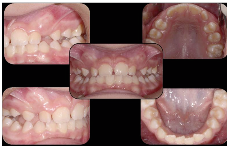
Figure 1. Photographic examination.